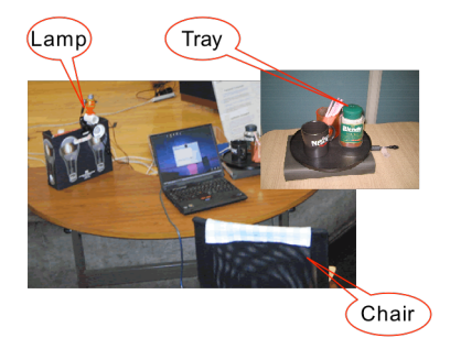
Figure 2: Smart Assistant application in workshop demonstration