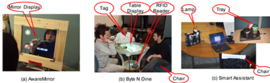
Fig. 2. Sample Applications Developed using Prottoy

This component is dynamically generated when the application is deployed and runs at application space. This component is non-editable and is primarily created targeting the end users of the application developed using Prottoy. So we can consider it as a macro running on top of Prottoy. The preference manager provides endusers with the facility to enable or disable the participation of any artefact in the application.