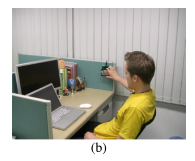
Fig. 1. DroPicks in action: At the left user leaves something behind to a common area augmented display. In the next figure, he picks up content from his personal space.

Three design principles are followed in DroPicks. These are: